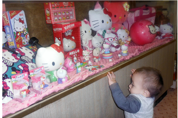
HELLO KITTY EXHIBIT ATTRACTS YOUNG AND OLD!