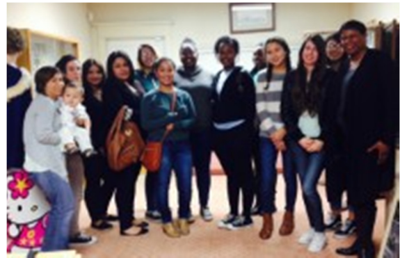
DUARTE TEEN CENTER GIRLS' NIGHT OUT—TO THE DUARTE MUSEUM