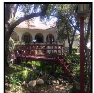
1632 Royal Oaks