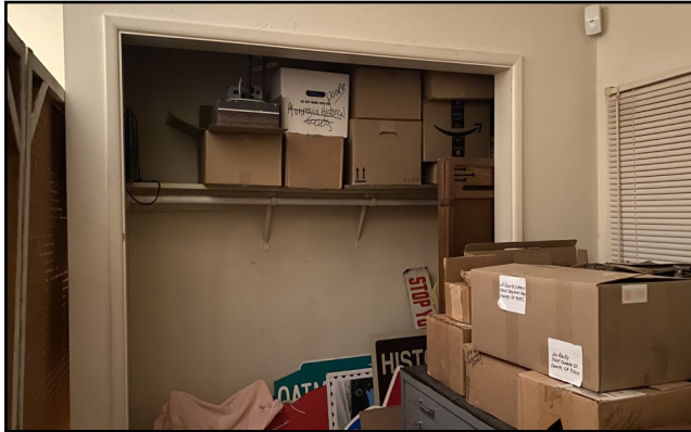
↑ CLOSET BEFORE

The entire room has a new coat of paint. I hope you all will visit now that the work has been completed. It looks quite impressive.