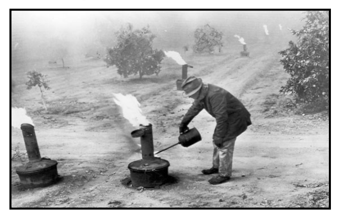
Torch being used to light smudge pots in citrus grove during cold temperatures, creating a blanket of smoke.

The smudge pot would not be acceptable today in California because it creates a blanket of smoke (air pollution) to work.