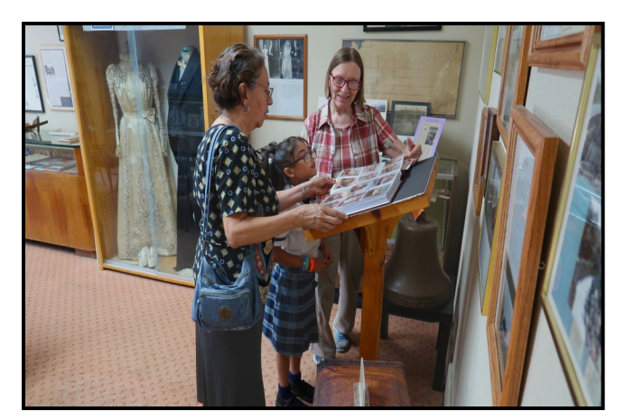
Visitor and granddaughter look through binder showing how the Duarte Museum was moved to Encanto Park.

Please join us for what will be a very inspiring event.