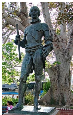
King Carlos III of Spain